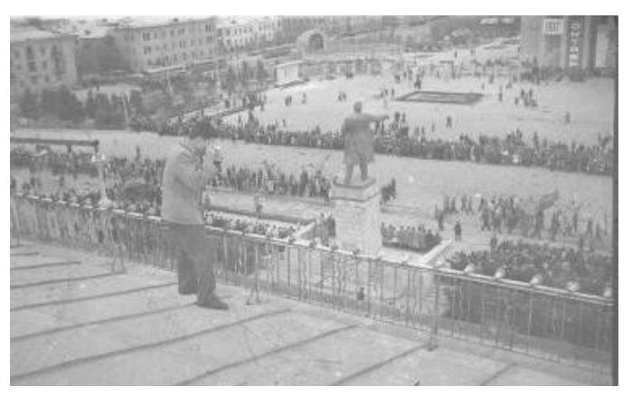
Peaceful protests in the central square of Sumgayit

On the 26<sup>th of</sup> February, the central square of Sumgavit was stormed by protesters who objected to the killing of two Azerbaijanis were that shot by Armenians in the Nagorno-Karabakh region of Azerbaijan just four days prior. The raised tension in the city was seen as an opportunity in the hands of Armenian nationalists to carry out their provocation against Azerbaijan. In order to arouse anger and increased stamina, the recent clashes in Nagorno-Karabakh had been intentionally misreported to a growing making think crowd, them