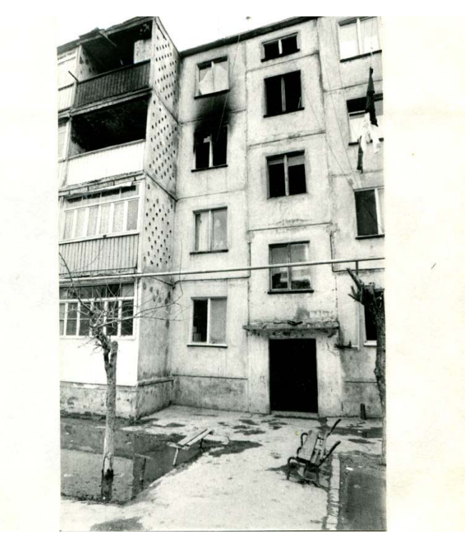
Sumgayit building attacked by raiders

One of the most destructive weapons used during the Sumgayit events information blockage leaving Azerbaijanis